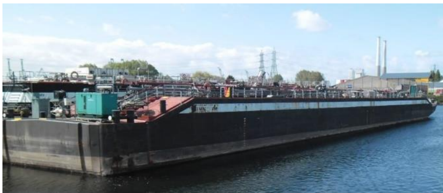
Sister barge picture

Tank Barge: Non self-propelled / name: SM 10 Tonnage: 2360 tons 2458 m3 Built: 2001 in France Dimensions: 79,00 x 11.45 x 3.50m Class: Type C / double hull / Bureau Veritas valid till 01-02-2026 Tanks: 7 / 50 kpa pressure . Tank coating: Yes hempadur 15600 / no heating coils from shore / no kettle. Pumps: FRAMO Submergible Pumps 7 x 200m3 Engine: None Bow thruster: Yes, 300 HP Hydromarmor tunnel pipe system/ plus bow ruder Generator: John Deere 63 Kva Deckhouse: no accommodation, the engine room is used for all equipment to be stalled and also the bow-thruster. General; This tank barge is in very good state optional and technical. The barge is fitted with a real engine room under the foredeck. It is a closed room. - Fitted with a Bow thruster 300 HP. - The barge carries white products, benzene, methanol. Tanks are in excellent condition. Location: West of France. Price: € 1.050.000,- / delivery under approval owner